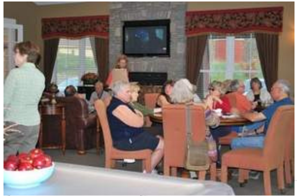
Special to the Asheville Citizen-Times