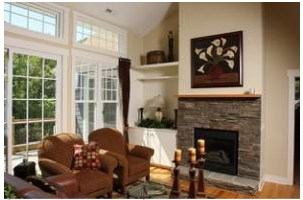
Special to the Asheville Citizen-Times

The Orchards of Flat Rock TheOrchardsofFlatRock.com 828-697-5022